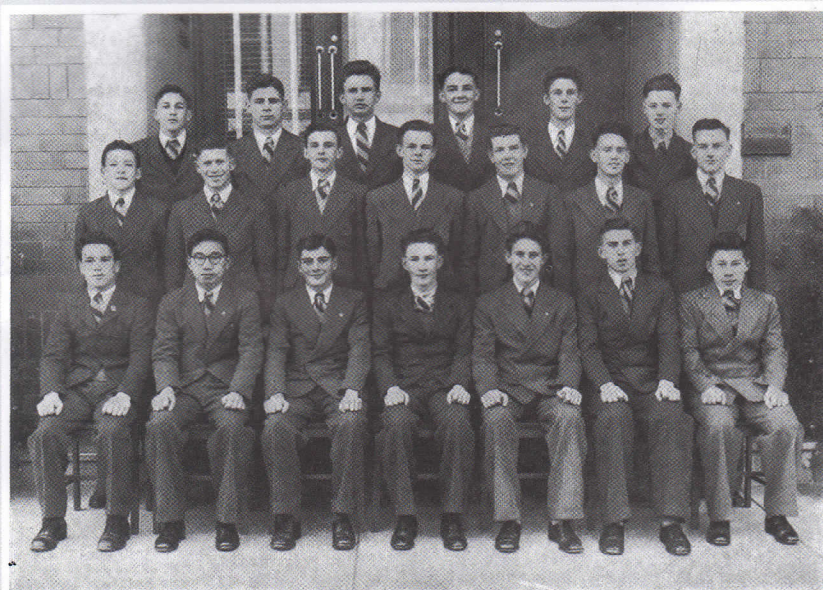
LEAVING CERTIFICATE CLASS